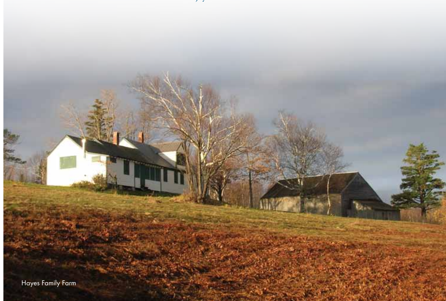
Hayes Family Farm